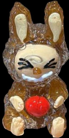
Right = 29cm x 16 cm