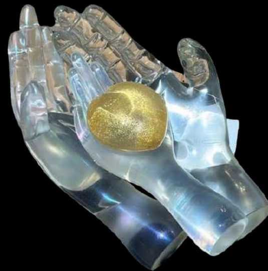
21cm x 37cm