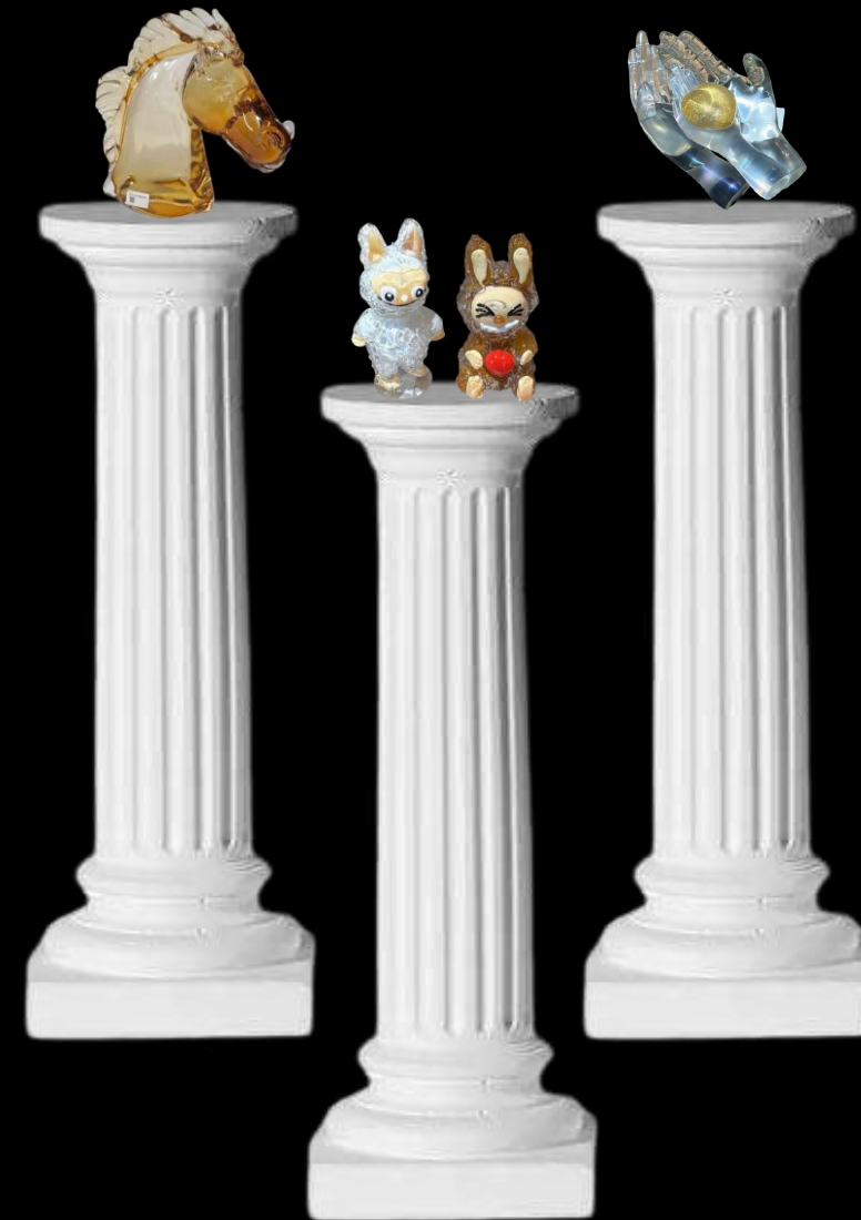
*For reference only