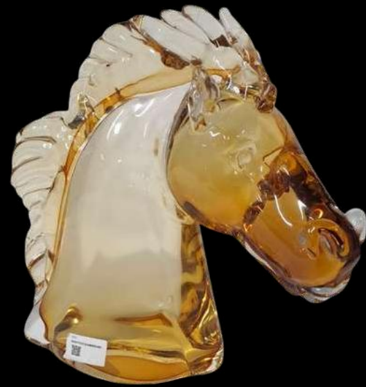
31 cm x 29 cm