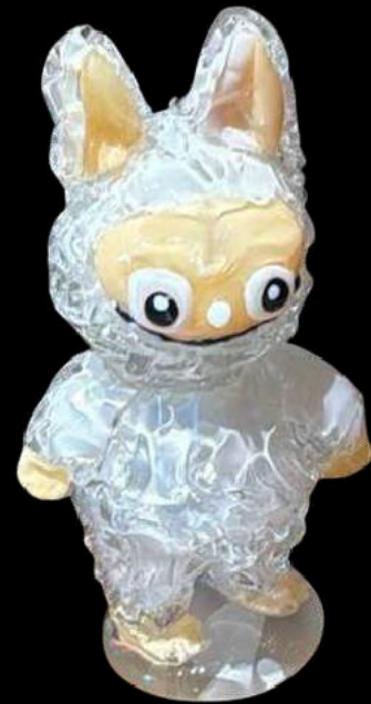
Left = 31cm x 16 cm